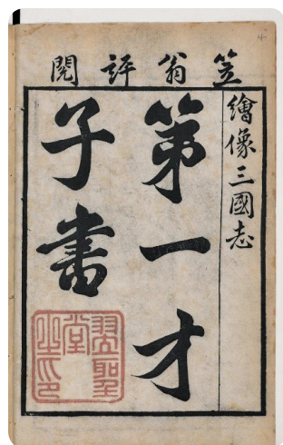
Li Liweng's Annotated Romance of the Three Kingdoms in BnF

portrayals of the Three Kingdoms period. It stands as a remarkable example of the fusion of visual artistry and literary tradition.