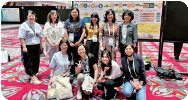
Taiwanese delegates at the poster session venue

NCL's featured presentation, titled "Leveraging NCL's ETD Repository: Introducing WriteAid Similarity Scanner", highlighted the collaborative development of the WriteAid Similarity Scanner with National Taiwan Normal University. This tool utilizes NCL's extensive ETD archive to assist graduate students in enhancing the originality and quality of their academic writing. The poster attracted considerable interest from international professionals, facilitating productive exchanges and promoting NCL's innovative services on a global stage.