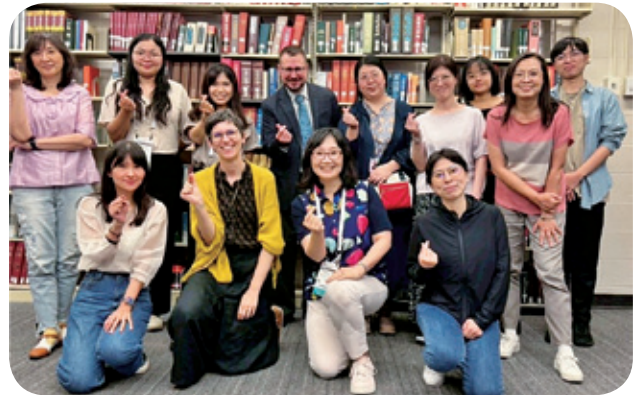
ALA 2025 delegation visiting the University of Pennsylvania Libraries

Coinciding with the "Free Museum Days" in Philadelphia, conference attendees had the opportunity to explore the city's renowned historical and cultural institutions. These visits offered inspiration and fresh perspectives, energizing future efforts to develop innovative library services back home.