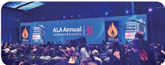
A view of the opening ceremony venue

The ALA Annual Conference is one of the world's most significant gatherings in the field of librarianship, drawing thousands of librarians, educators, authors, publishers, and information professionals from across the globe. This year's conference featured nearly 200 sessions, including lectures, forums, discussions, and workshops, covering topics such as reader services, community engagement, STEM education, and emerging library technologies. Over 500 vendors also exhibited their latest products and services.