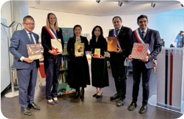
Taiwan-France Friendship, Levallois City warmly welcomes quality books from Taiwan