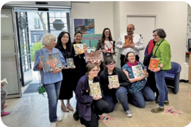
The Taiwan Corner is open and welcoming readers at the Sorbier Library