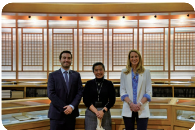
A group picture in NCL's Rare Books Room