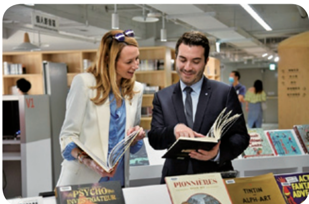
The French-language comics on offer in the OPEN LAB attracts the interest of these honored guests