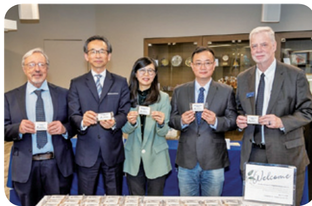
NCL and University of Toronto celebrate the 10 th anniversary of the university's TRCCS and hold a Taiwan Lecture on Chinese Studies