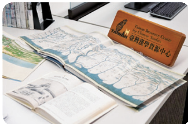
TRCCS has worked to provide academic resources and cultivate exchange between Taiwan and Canada over the course of a decade