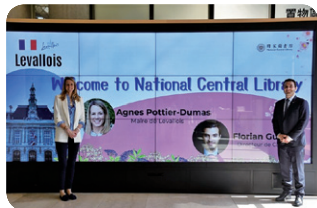
The NCL interactive wall welcomes Mayor Pottier-Dumas

Levallois-Perret is a prospering town in the Île-de-France Hauts-de-Seine region of France near Paris. During the 2024 Paris Olympics and Paralympics, Levallois-Perret provided free spaces for Taiwan's athletes to train, providing a great deal of labor and material assistance to those athletes, therefore making an outstanding contribution to the impressive performance of Taiwan's athletes.