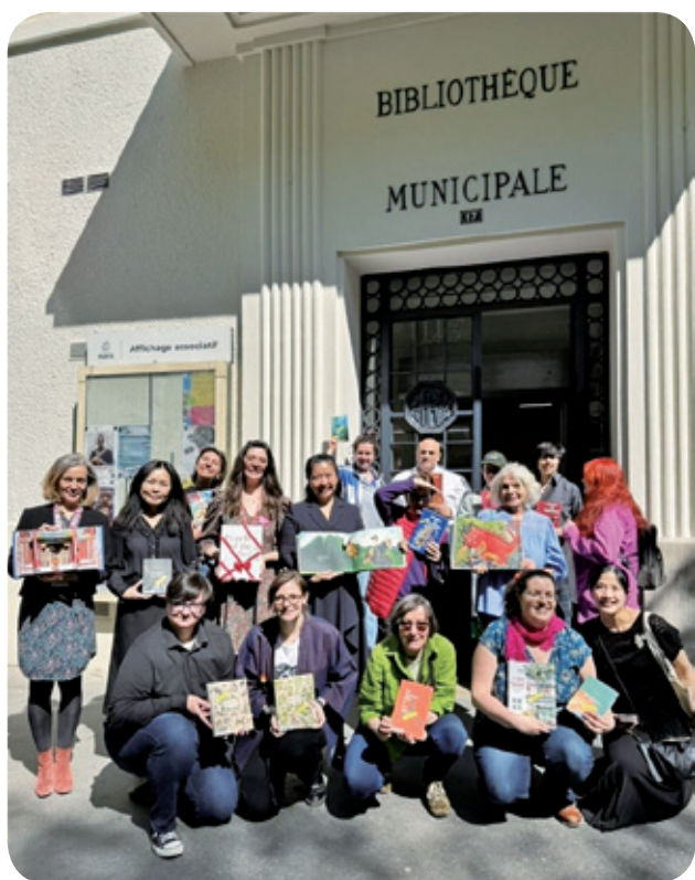
The Sorbier Library has a strong community and deep connections with residents