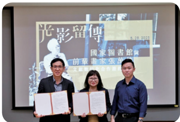
A shot after both parties signed the agreement