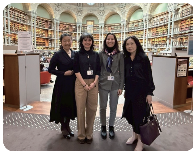
Tour of the Richelieu Site of the BnF

The NCL and BnF share a longstanding relationship, having collaborated on Chinese rare book digitization projects in 2015 and again in 2024.