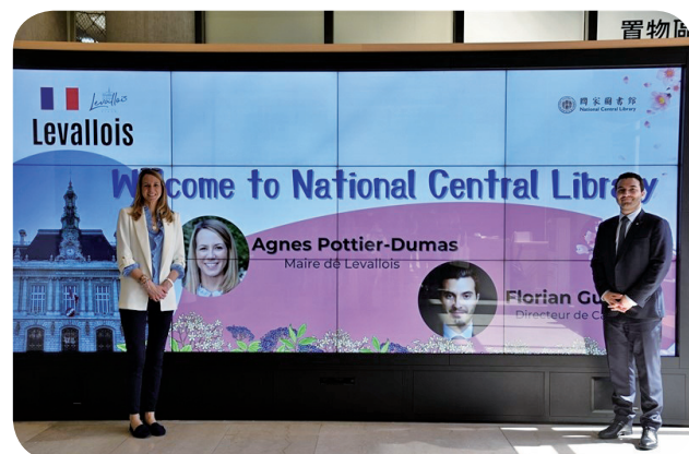
The NCL interactive wall welcomes Mayor Pottier-Dumas

Levallois-Perret is a prospering town in the Île-de-France Hauts-de-Seine region of France near Paris. During the 2024 Paris Olympics and Paralympics, Levallois-Perret provided free spaces for Taiwan's athletes to train, providing a great deal of labor and material assistance to those athletes, therefore making an outstanding contribution to the impressive performance of Taiwan's athletes.