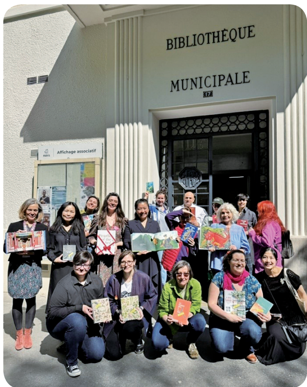
The Sorbier Library has a strong community and deep connections with residents