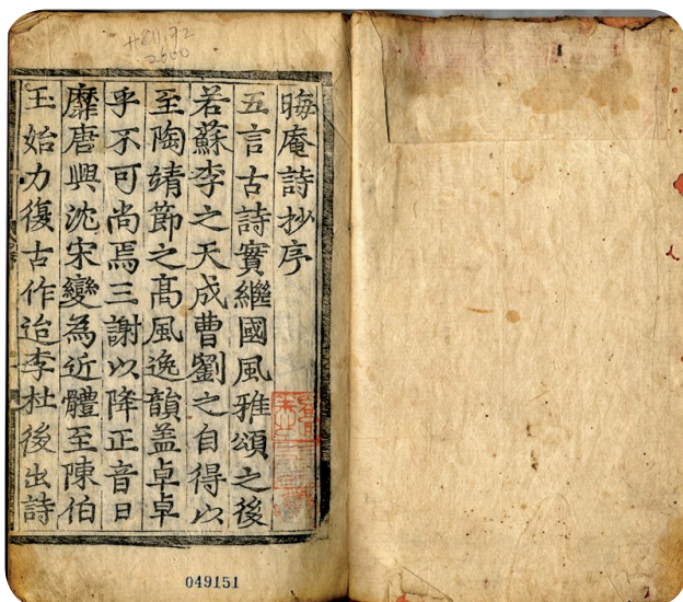
A view of the preface of Huian xiansheng wuyanshi chao