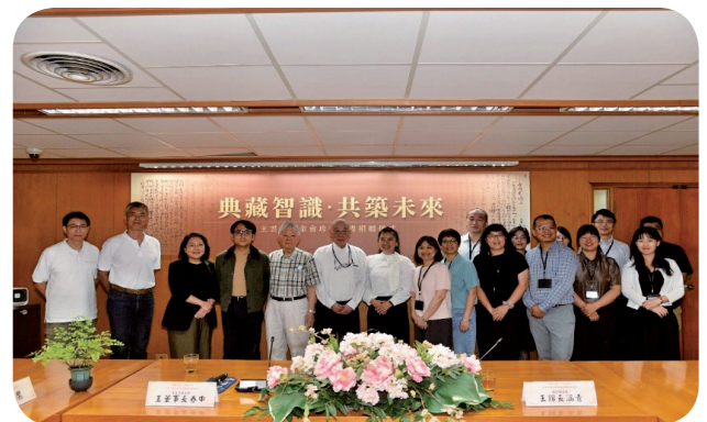
Dignitaries present at the donation

NCL and the Yun-wu Wang Foundation have long collaborated, not only co-organizing the “Yun-wu Wang International Forum on Self-directed Learning” but also completing the digitization and public access of his manuscripts. The donation of Mr. Yun-wu Wang's personal book collection marks yet another milestone in this partnership, opening a new chapter of cooperation. Both parties look forward to continuing to work hand in hand to promote cultural sustainability and the broad dissemination of knowledge.