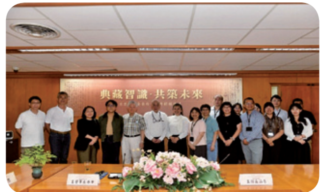
Dignitaries present at the donation

NCL and the Yun-wu Wang Foundation have long collaborated, not only co-organizing the “Yun-wu Wang International Forum on Self-directed Learning” but also completing the digitization and public access of his manuscripts. The donation of Mr. Yun-wu Wang's personal book collection marks yet another milestone in this partnership, opening a new chapter of cooperation. Both parties look forward to continuing to work hand in hand to promote cultural sustainability and the broad dissemination of knowledge.