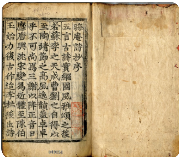
A view of the preface of Huian xiansheng wuyanshi chao