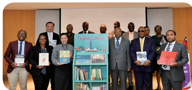
Esteemed guests take group photo with donated books from the Taiwan Corner

of each Taiwan Corner focuses on promoting Taiwan's history, local culture, and promoting Taiwan's cultural image and related information. Curated based on local needs, Taiwan Corners present diverse published materials suited to offer a launching pad from which citizens of various countries can learn about Taiwan at their own local libraries. This donation from NCL included children's picture books, three-dimensional pop-up books and maps of Taiwan, as well as books on a variety of diverse themes from Taiwan, including history, local cultures, the natural environment, literature, arts, and more.