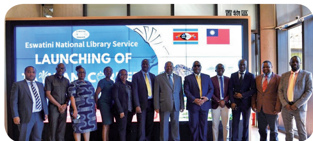
The Eswatini delegation takes a group photo in the NCL lobby

Ministry of Education, and the International Trade Administration of the Ministry of Economic Affairs for their assistance in the facilitating this donation. The completion of this donation emphasizes the value Taiwan places on cultural exchange.