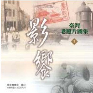
Cover photo of Photographic Memories: Historic Photos of Taiwan (Vol. 1)

background and significance of the photo.