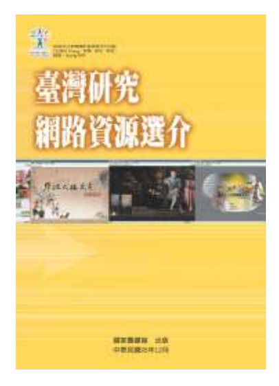
Cover photo of Introduction to Online Resources for Taiwan Studies

The book aims to deepen public awareness and understanding of Taiwan, while also fostering public interest in continuing education, research and reading. The book also helps readers make the most out of a wide range of e-library sources, both as a replacement for and complement to written works and visits to physical libraries. (Chinese text by Chung Hsue-chen)