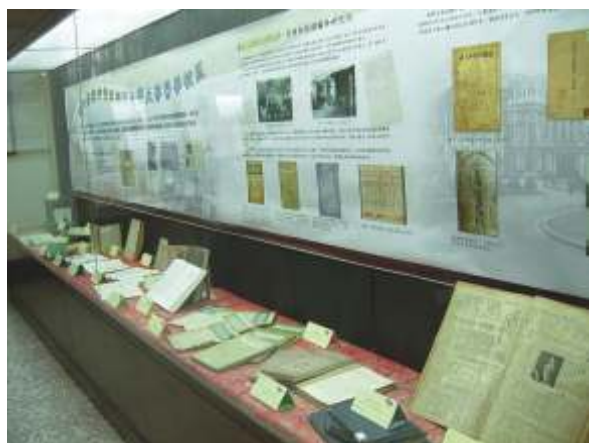
Displays at the Rare Medical Books Exhibition

Readers can see many of the works during the 110th anniversary exhibition, including rare books, the thesis papers of early researchers at the College of Medicine, books on the history of the NTU College of Medicine, and an introduction to resources on the history of medicine in Taiwan.