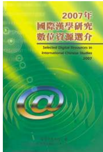
Front cover of Selected Digital Resources in International Chinese Studies 2007

Selected Digital Resources in International Chinese Studies for the seminar and provided it to scholars and institutions, winning favorable reviews.