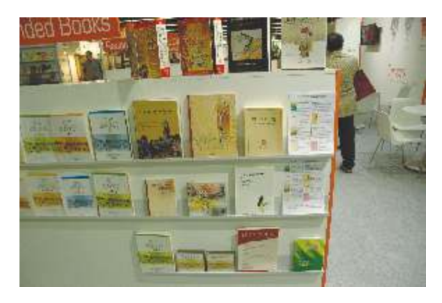
NCL publications on display at the "Recommended Taiwan Books" section

Taiwanese publications grabbed the spotlight at the 2007 Frankfurt Book Fair, with over 677 volumes on display by 64 publishers. The Taiwan Pavilion at this year's show, which ran from October 10 to 14, was sponsored by the Government Information Office and organized by the Taipei Book Fair Foundation. The pavilion display was arranged into 10 categories, including titles presenting the rich history and culture of Taiwan. The exhibit also highlighted the diversity of Taiwan's publishing industry and opened up new channels for publishing right deals. One section of the pavilion was devoted to recommended books which exhibition staff introduced to potential buyers of publishing rights.