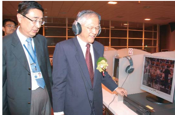
Minister of Education Cheng Jui-cheng (right) inspects media viewing equipment at the National Central Library's Arts and Audiovisual Center with NCL Director-general Karl Min Ku (far left).

Since moving to Zhongshan South Road in 1986, the NCL has faced a growing need for space as its collection swells. To address this need, former library director-general Juang Fang-rung worked tirelessly to secure the Shih Chien Hall for the library's expansion. The new center is housed in the hall, situated about 900 meters from the main library, enabling close mutual service support between the two locations. The 2,277-square meter center was established with funding from the Ministry of Education (MOE) and has a holding capacity for about 250,000 volumes (items), or enough to accommodate six-year's of future collection growth