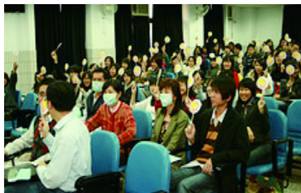
Teachers and students sound off at Fu Jen Catholic University

For the "Taiwan LIS Forum: LIS ShareLand"