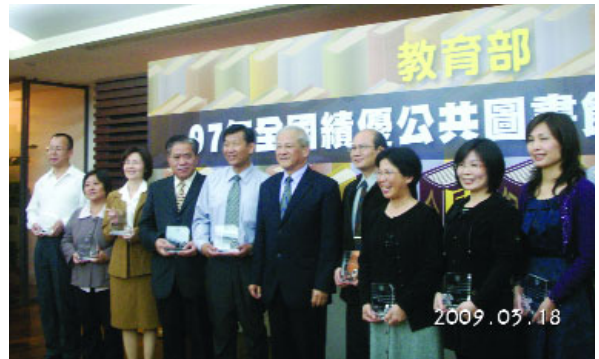
Minister of Education Cheng Jai-cheng (fifth from right) with public library award winners

The Gold Library Award winners were Puli Township Library in Nantou County, Hualien City