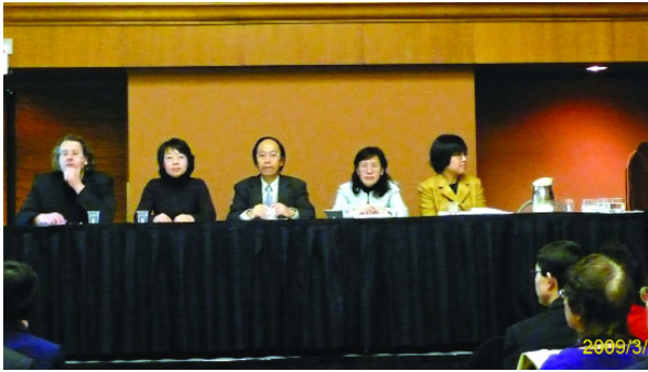
Speakers at the CEAL meeting

Hyweb Technology Co., and Mandarin Library & Information Services Co.