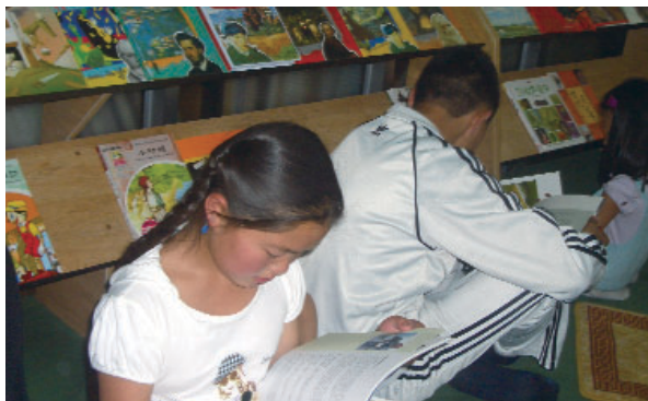
Taiwan Reading Garden at the Book Palace Children.

The opening of the new reading room represents a major step forward in the NCL's efforts to expand international cooperation ties and contribute to the endeavor of global cultural resource sharing. It also continues in a trend of steadily deepening relations between Taiwan and Mongolia in recent years. Today, Taiwan is an important trading partner of Mongolia. In addition to trade and investment ties, the two sides have also strengthened cooperation in the fields of education, science, technology, and tourism. Education exchanges and cultural studies have helped Taiwan and Mongolia to foster mutual awareness of their society, history and customs, deepening understanding and cooperation between the two sides.