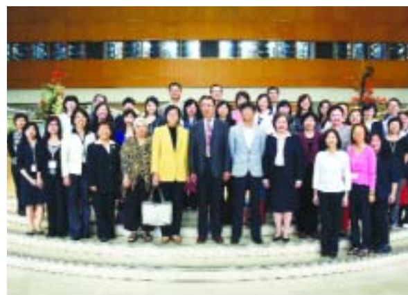
Participants at the forum.

The NCL and Library Association of the Republic of China (LAC) invited 23 members of the Hong Kong Library Association to participate in a Taiwan-Hong Kong Library Association Forum at the NCL on October 23 to 26. Topics discussed at the forum included: the "Role and Function of the NCL," "NCL Collection Characteristics and Digitization Work," "Role and Function of the LAC," "Cooperation between the NCL, LAC and Other Taiwan Libraries," and "Overview of Library and Information Science Education in Taiwan." At the end of the forum, the participants visited Academia Sinica, the National Palace Museum, and Taipei Public Library.