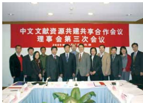
Participants at the conference.