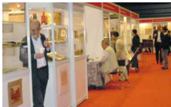
Antiquarian Bookfair in Hong Kong.