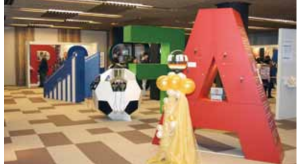
A view of Exhibition

The National Central Library (NCL) and Goethe Institute in Taipei held “Understand Germany - Three-Dimensional Audio-Visual Exhibition of German Letter” on December 19, 2009, to January 8, 2010, at the NCL. The exhibition combines art design with innovative multimedia to introduce Germany’s history, culture, politics, and economy. Chinese-German bilingual guides, Q & A, German songs teaching, quiz games, elementary German language teaching, German food, studying in German and traveling in German information were also provided during the exhibition.