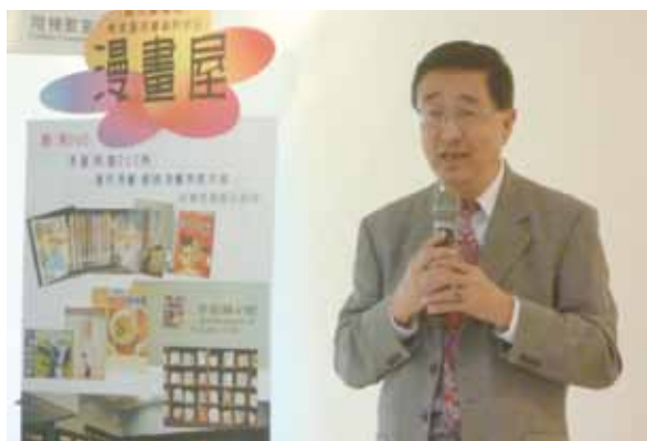
Opening ceremony of the NCL “Graphic Novel and Comics Room”, a collection of manga and graphic novels.