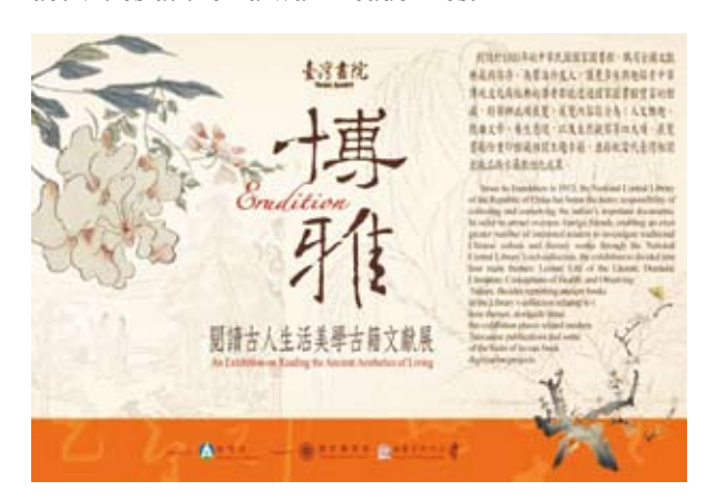
"Erudition: An Exhibition on Reading the Ancient Aesthetics of Living."

This year NCL has continued to add to the book collection in three Chinese Studies Academies established in 2010 as a way to promote Taiwanese culture. It will also add a new column to its Newsletter for Research in Chinese Studies called "Taiwan Academy" to make related news more accessible. In addition, NCL will work with the Chinese American Librarians Association (CALA) and the Council on East Asian Libraries (CEAL) to assist with marketing the Chinese Study Academies and finding and training volunteers in New York, Houston, and Los Angeles. News and information about the Taiwan Academy will be periodically sent through their respective news channels. Members of CALA or CEAL will be invited to attend activities at the Taiwan Academies.