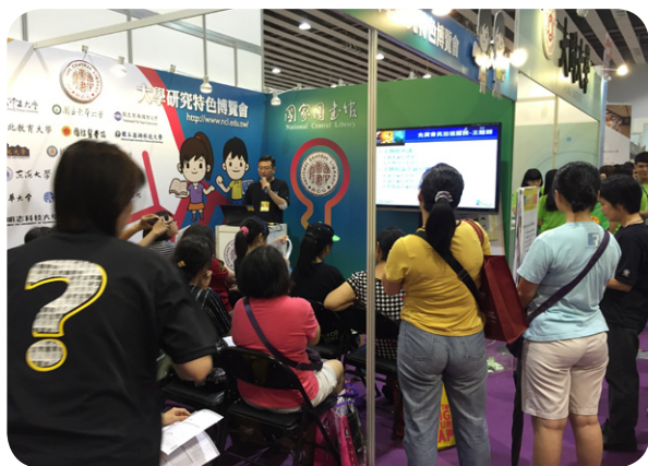
The NCL booth attracts many students and parents.

this system is the best study tool for students during their studies and in doing research work, Through this activity, students can establish “Academic theses public authorization,” promote the concept of “Put an End to Plagiarism” in order to obtain for more theses authorization in the future.