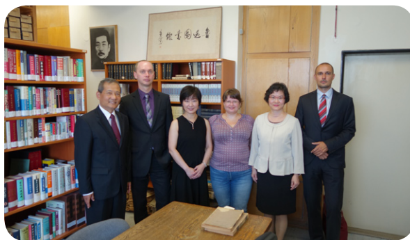
Group photo at the Oriental Institute of the Academy of Sciences of the Czech Republic.