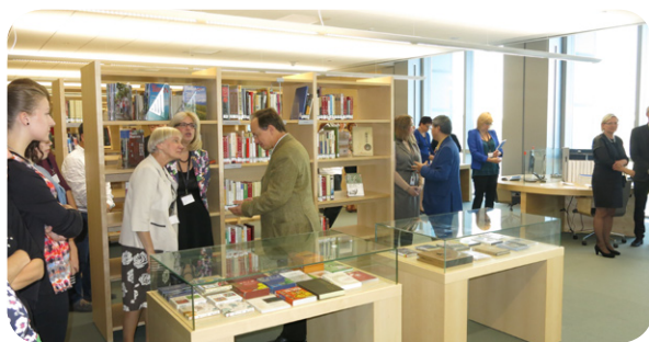
Many people attend the “Exhibition: Imprints of Civilization.”

This exhibition was focused on the development history of Chinese printing and related technologies, including the writing, printing, and distribution of books and other book-related activities. On display were inventions related to printing techniques and the developments in the printing industry. These showed the influence printing had on traditional social values in China. The exhibition also provided attendees the opportunities to try their hand at block printing, movable-type printing, thread-bound books, and Chinese calligraphy, allowing them to better understand Chinese culture and the content of the exhibition.