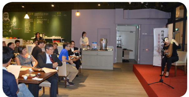
A visiting scholar plays the pipa at the tea party.

On September 21, 37 visiting scholars and their families from 19 countries of the CCS Research Grants for Foreign Scholars in Chinese studies and MOFA Taiwan Fellowship were invited to a Mid-Autumn Festival celebration tea party. The occasion aims to offer scholars, besides doing research, the opportunities to experience the cultural significance of the traditional folk festivals in Taiwan.