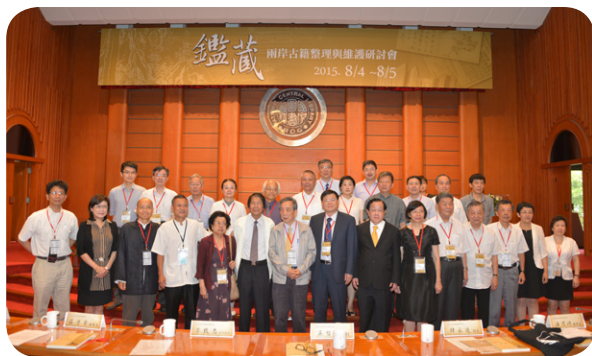
Group photo of all the guests of the “Collection Evaluation: Cross-Strait Conference on Classification and Preservation of Ancient Chinese Books.”