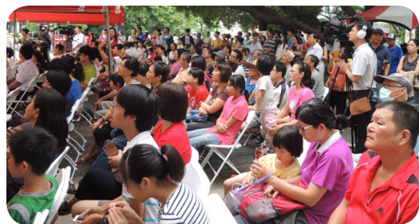
A crowd of people participating in the inauguration ceremony of Tainan District Resource Center.

The Public Library Tainan District Resource Center was inaugurated on August 1st and set up on the 3rd floor of the Tainan Municipal Main Library. The collections of the Center is divided into four major themes zones: “multiculture,” “youth,” “culture and creativity,” “knowledge.” It is also combined with the Southern Regional Resource Center collections thus providing beyond counties and cities circulation loan service.